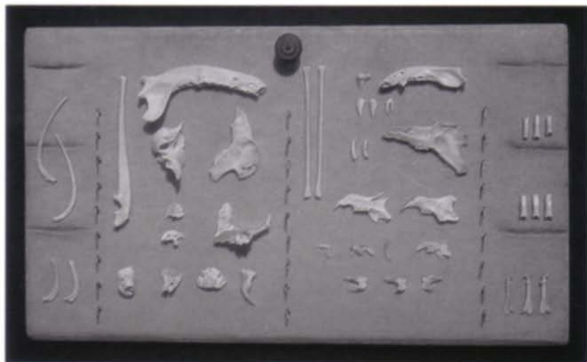
Marie-Josèphe Vallée, Histoire naturelle 10 , 1996. Collage of bones on velvet lined jeweler's show-case.

Marie-Josèphe Vallée, Constructions naturelles , Édifice Belgo, Espace 524, Montréal. September 10 - 27, 1998